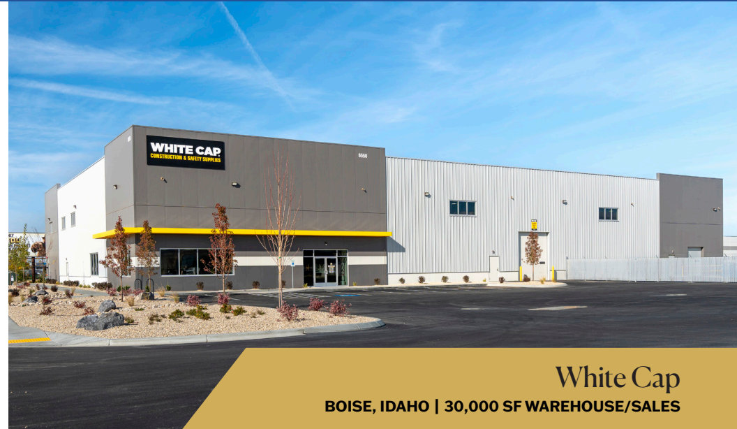
White Cap BOISE, IDAHO | 30,000 SF WAREHOUSE/SALES