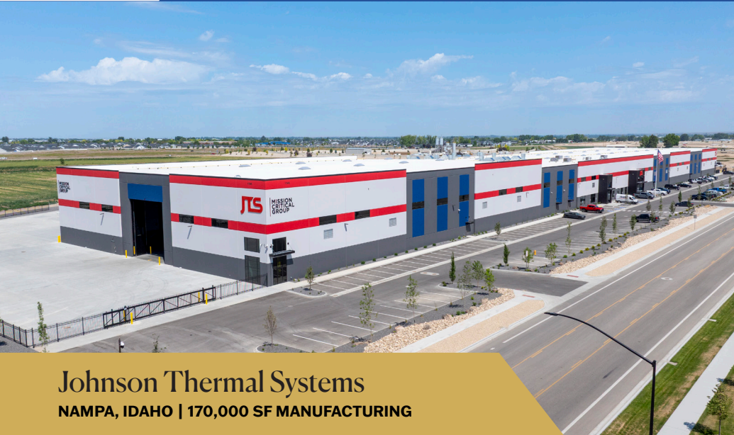
Johnson Thermal Systems NAMPA, IDAHO | 170,000 SF MANUFACTURING