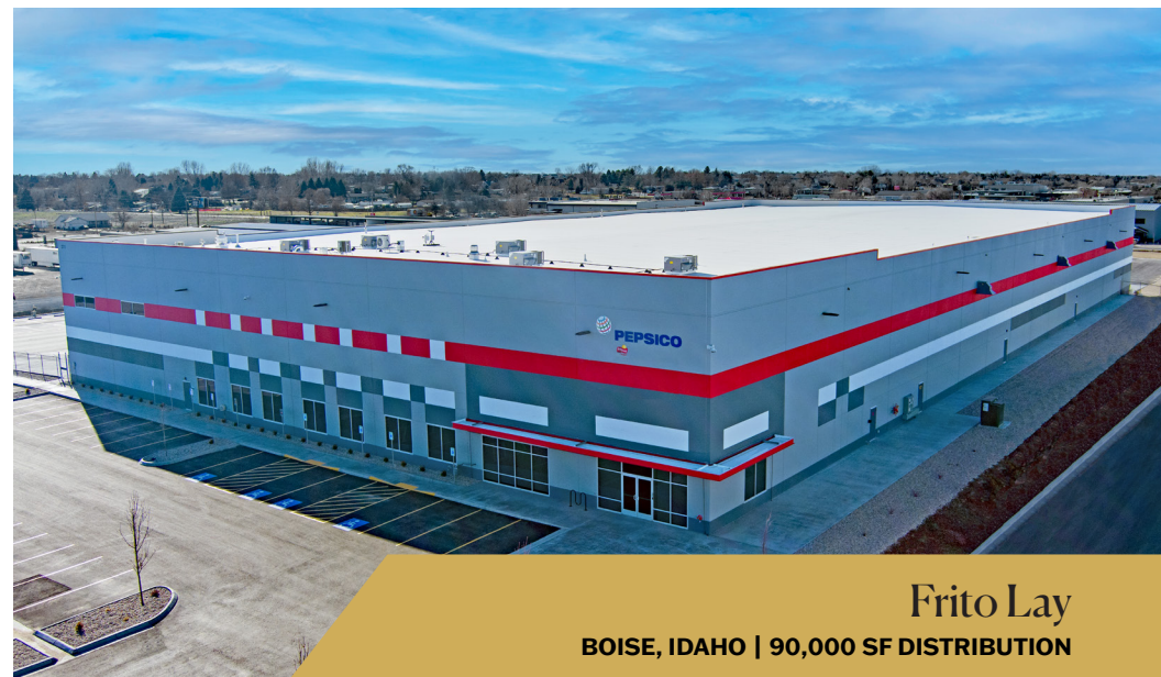
Frito Lay BOISE, IDAHO | 90,000 SF DISTRIBUTION