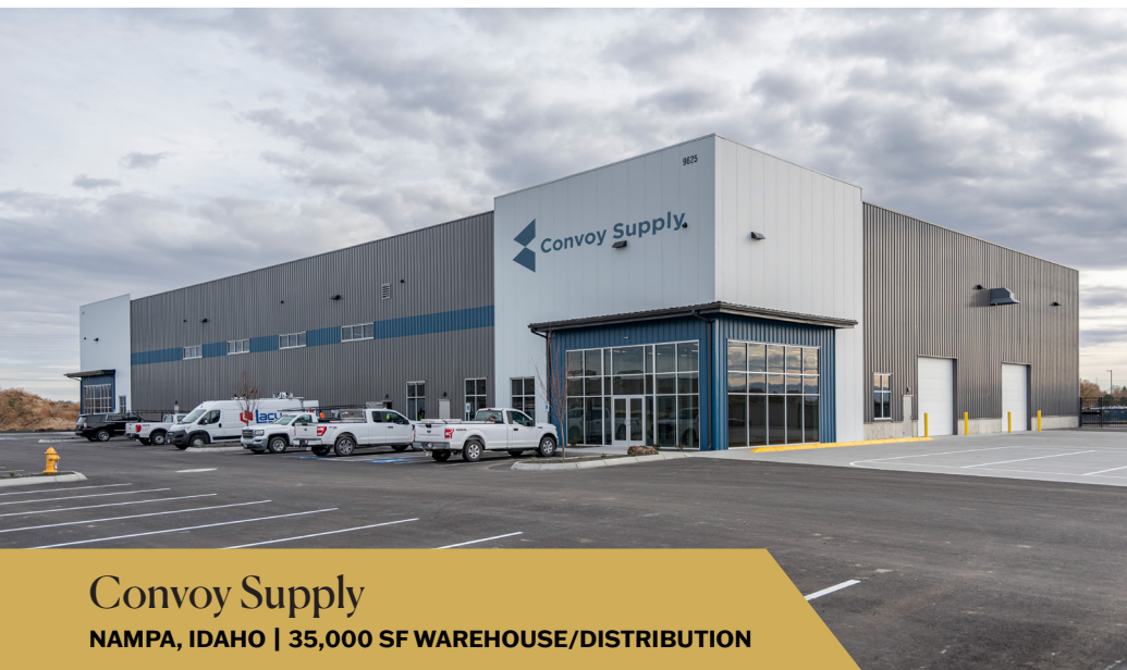
Convoy Supply NAMPA, IDAHO | 35,000 SF WAREHOUSE/DISTRIBUTION