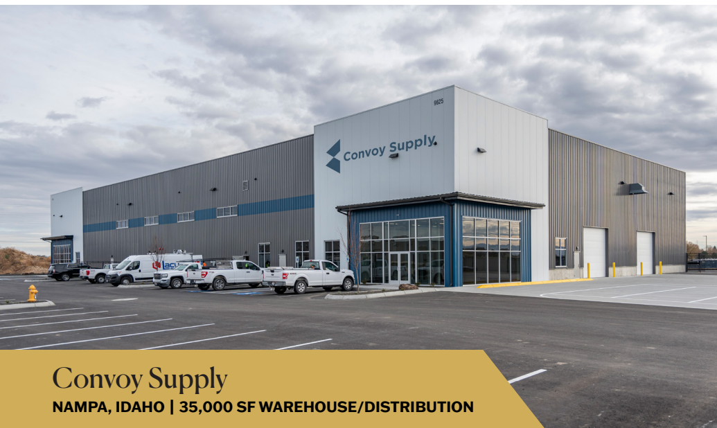
Convoy Supply NAMPA, IDAHO | 35,000 SF WAREHOUSE/DISTRIBUTION