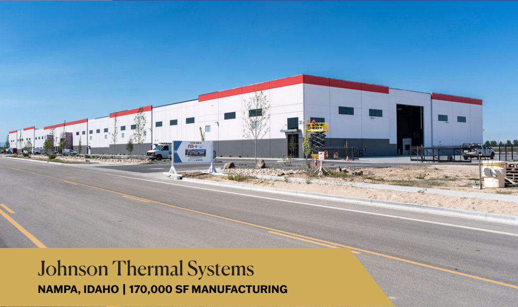
Johnson Thermal Systems NAMPA, IDAHO | 170,000 SF MANUFACTURING