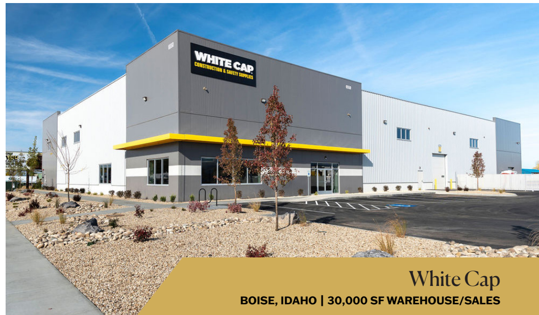
White Cap BOISE, IDAHO | 30,000 SF WAREHOUSE/SALES