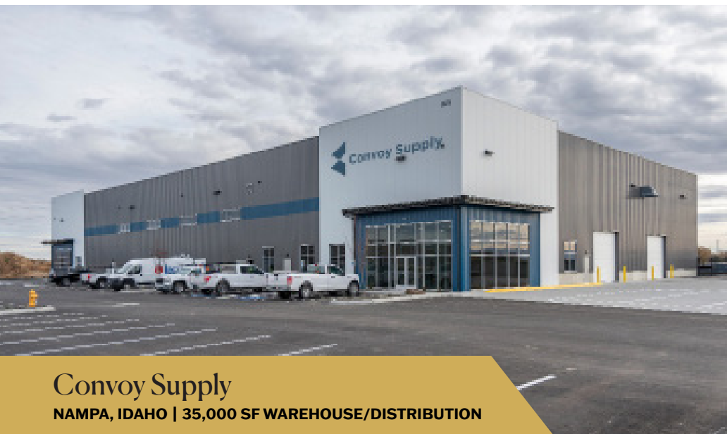
Convoy Supply NAMPA, IDAHO | 35,000 SF WAREHOUSE/DISTRIBUTION