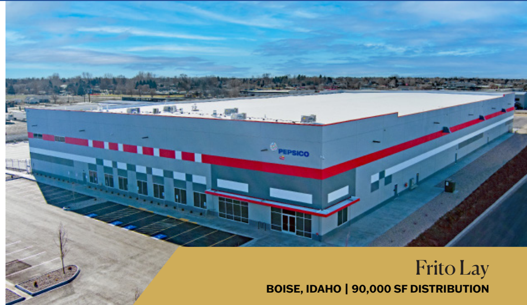
Frito Lay BOISE, IDAHO | 90,000 SF DISTRIBUTION