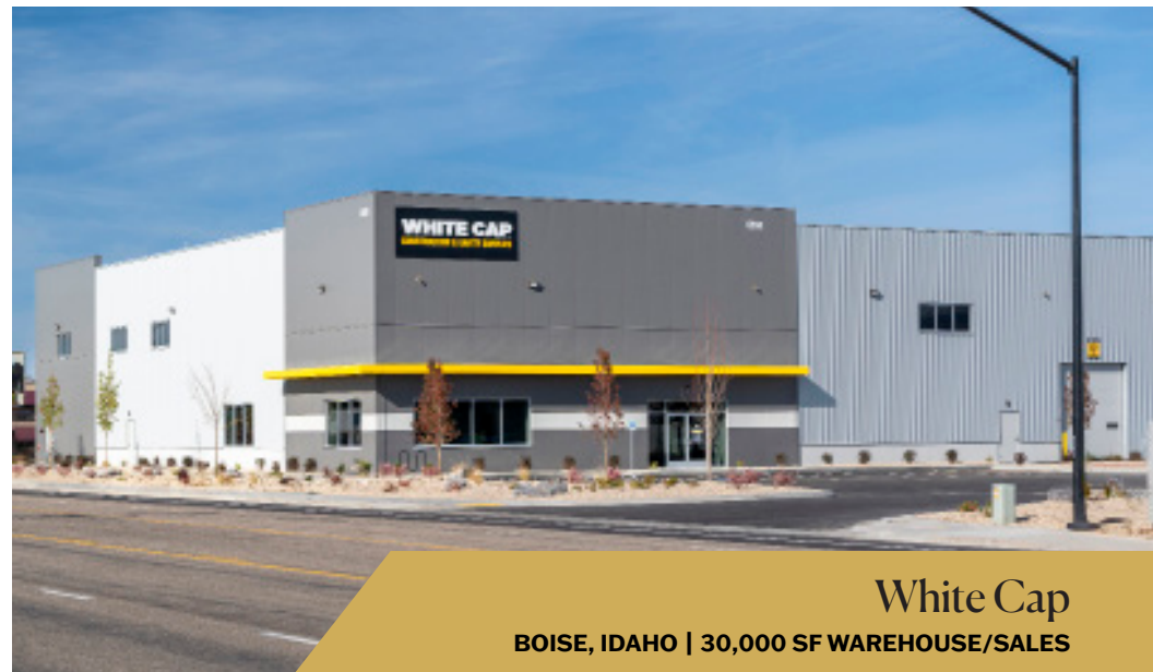
White Cap BOISE, IDAHO | 30,000 SF WAREHOUSE/SALES