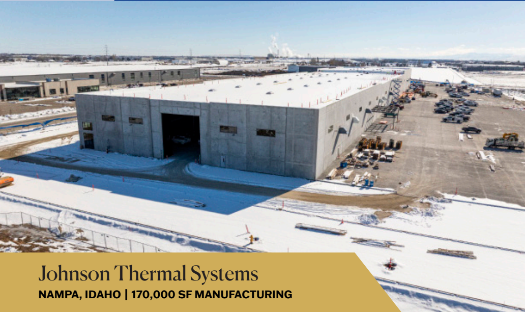
Johnson Thermal Systems NAMPA, IDAHO | 170,000 SF MANUFACTURING