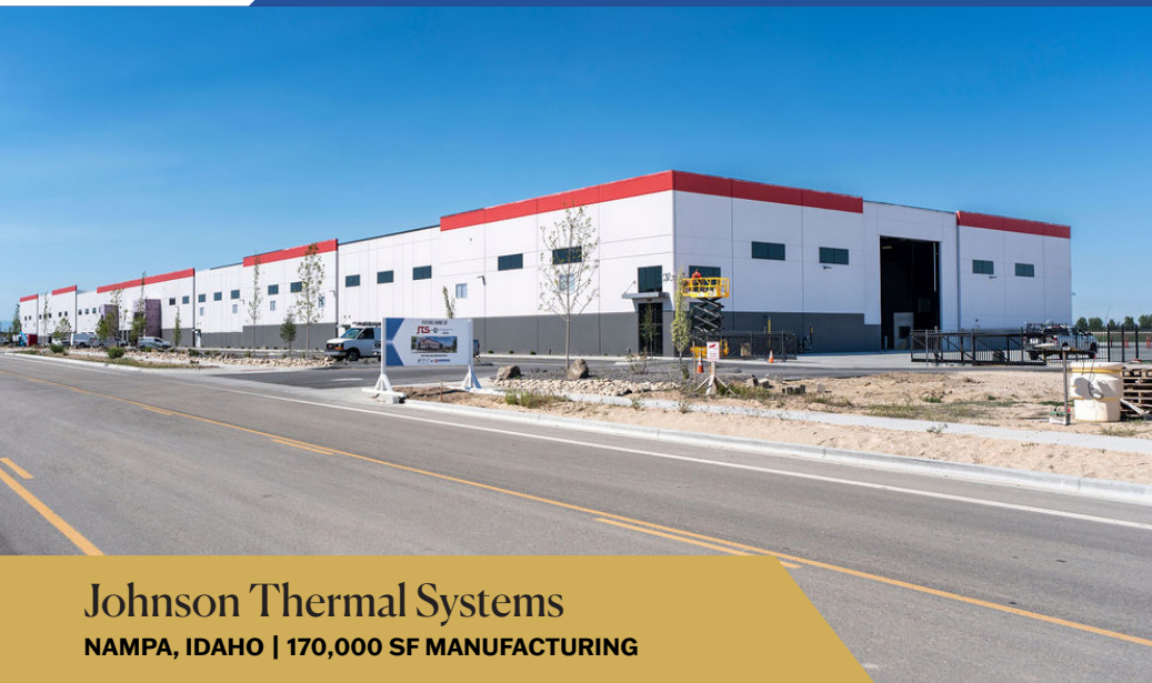
Johnson Thermal Systems NAMPA, IDAHO | 170,000 SF MANUFACTURING