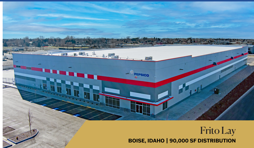
Frito Lay BOISE, IDAHO | 90,000 SF DISTRIBUTION