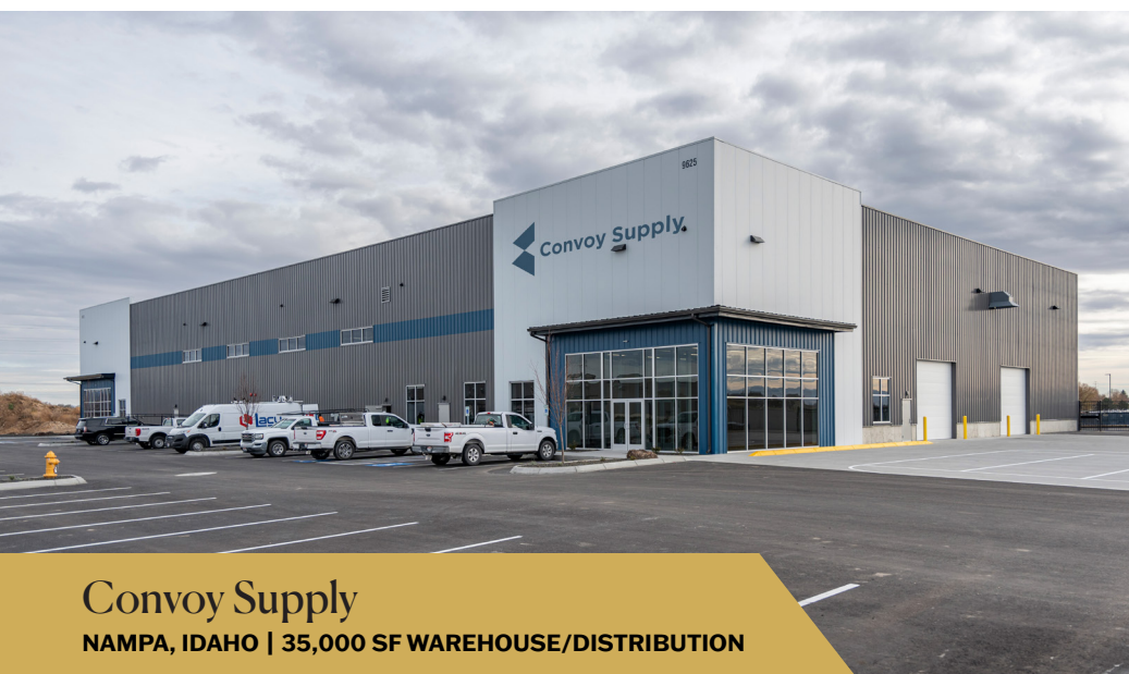
Convoy Supply NAMPA, IDAHO | 35,000 SF WAREHOUSE/DISTRIBUTION