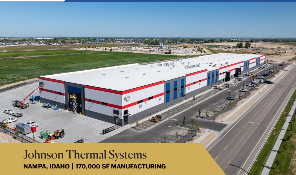
Johnson Thermal Systems NAMPA, IDAHO | 170,000 SF MANUFACTURING