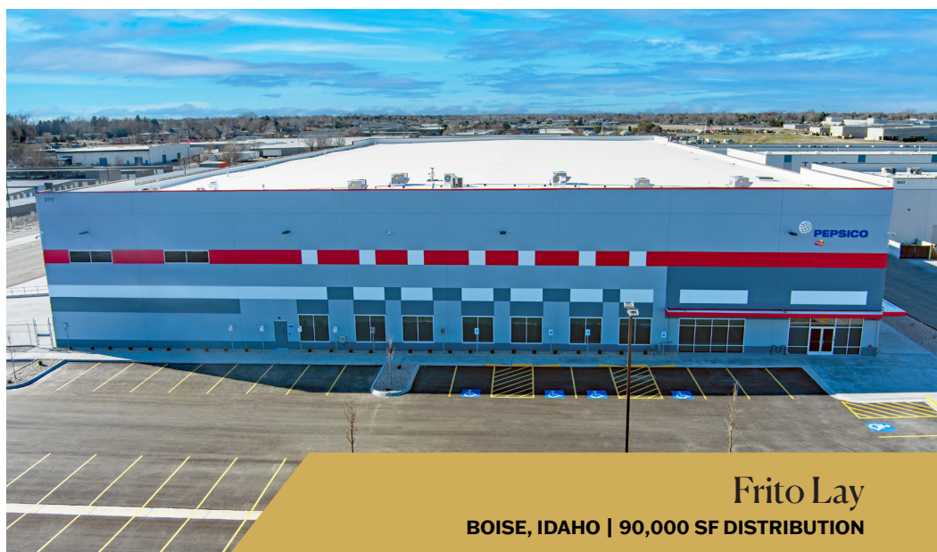
Frito Lay BOISE, IDAHO | 90,000 SF DISTRIBUTION