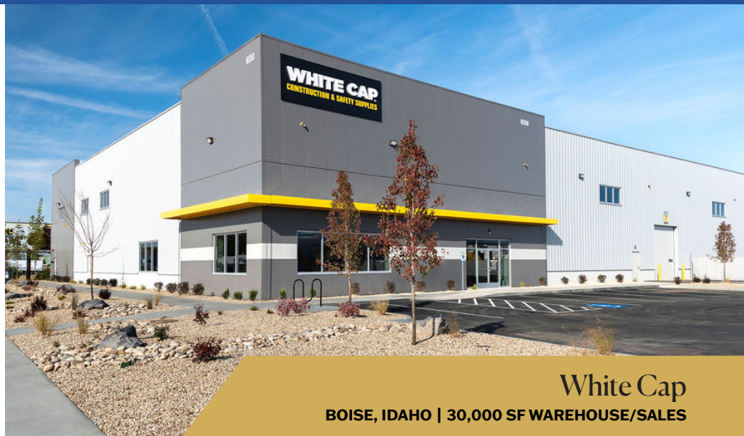
White Cap BOISE, IDAHO | 30,000 SF WAREHOUSE/SALES