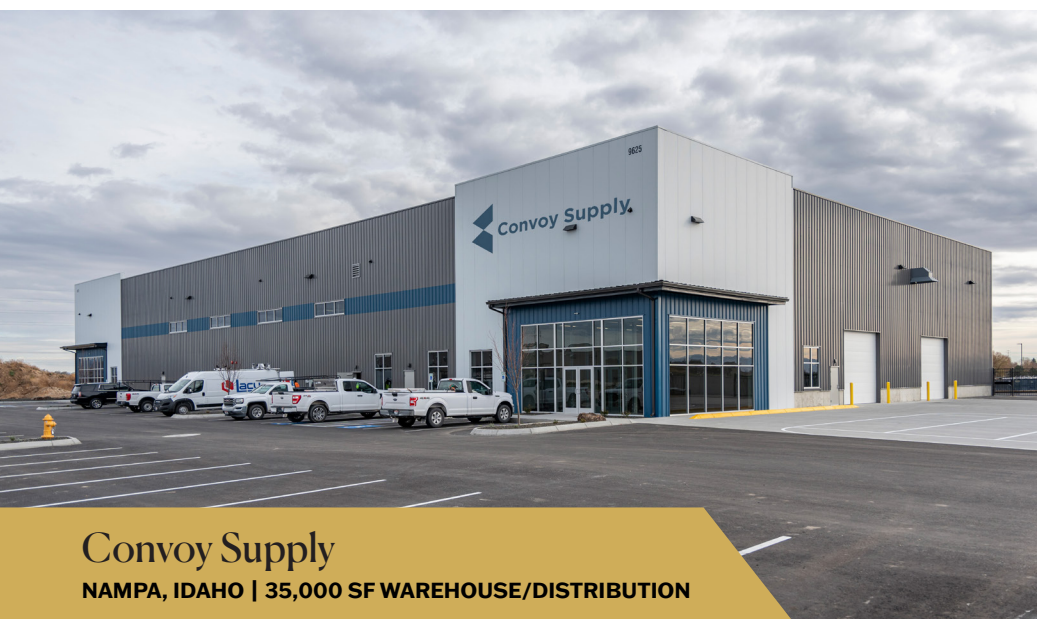
Convoy Supply NAMPA, IDAHO | 35,000 SF WAREHOUSE/DISTRIBUTION